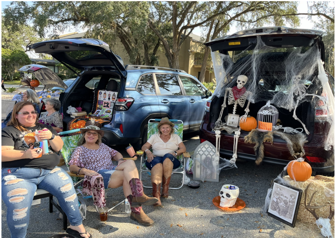
Teachers and Faculty of Timucuan Elementary School